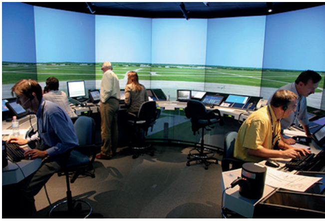
AirServices Australia training facility where EIZO Re/Vue products are installed

Synchronous ATG recording has developed as a real requirement as it is seen as a 100% accurate reflection of what a controller saw and did at a particular point in time by interfacing directly with the video signal. When synchronized with the recorded audio and other available data, it provides an unequivocally accurate version of events. Initially, ATG video recording technology was not mature enough to capture the 2K × 2K resolution used in ATM, even at very low refresh rates. Over time, manufacturers such as EIZO developed pixel-based solutions that offered lossless screen recording technology from 2K × 2K screens at up to 60 frames per second (fps). The recordings created by this new technology offered greater reliability along with much more portability and flexibility in file and data handling, and did not suffer from the drawbacks of X protocol-based recording.