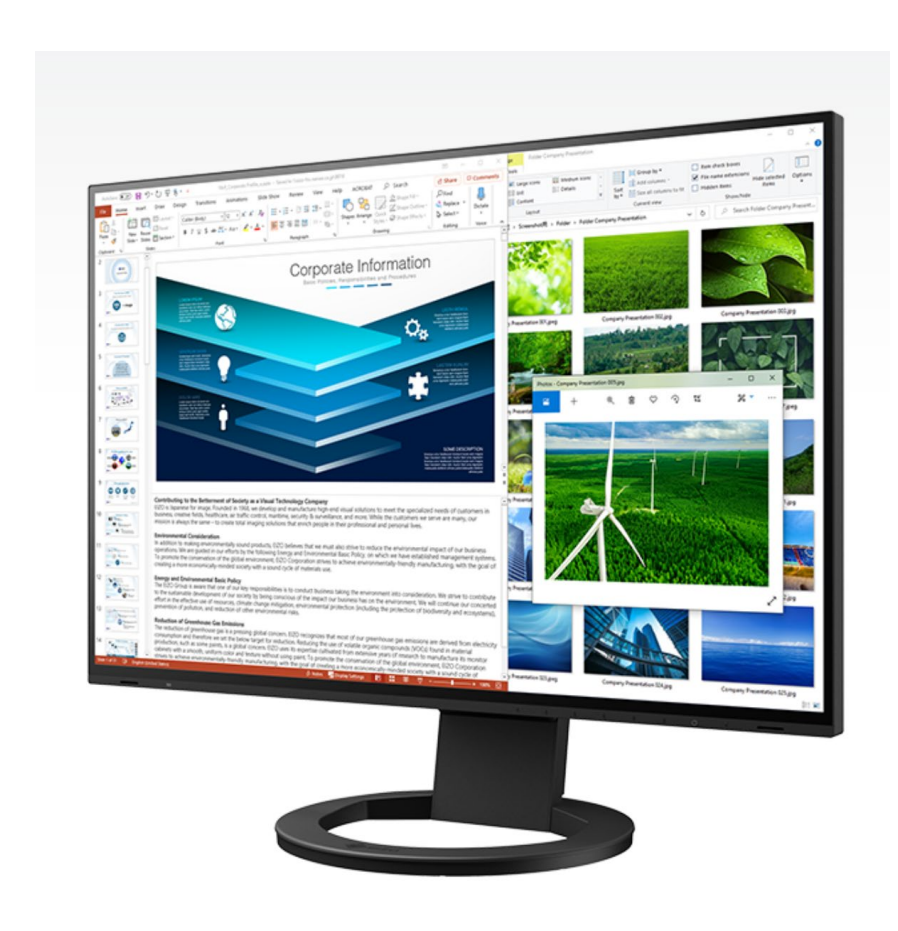
The 24.1-inch FlexScan EV2485, frameless LCD monitor equipped with USB Type-C for office hot desking and remote working.